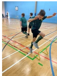
Year 8 PE students participating in an agility session

Swimming for Year 7 & 8 will begin week commencing 10 th October and will be on a rota basis. Your child will be informed when their swimming block (5 weeks) will start.