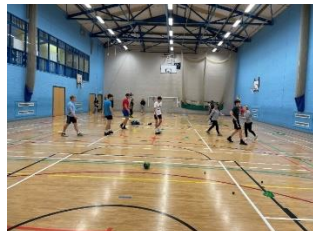
Year 12 Sports Leaders session.

The Sports Leaders award has proved to be a very popular enrichment option this year, with 20 students signing up to the course. These students will undertake theoretical lessons before embarking on a coaching journey, experiencing planning and evaluating physical activity sessions for primary students, as well as coaching students from the Learning Support Department and in the wider community. These students will develop confidence in their coaching abilities and is a nationally recognised certificate, so a great addition to their CV's. It also carries 16 UCAS points so will contribute towards a successful university application.