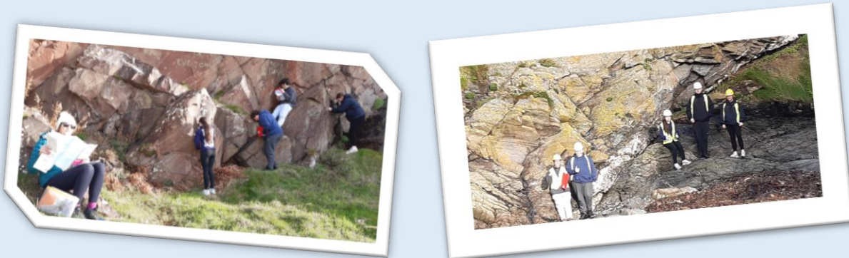
Making a field sketch of the turbidite fold below Peel Castle

On 22 nd and 23 rd October, our Geology students ventured out to the west of the Island. Investigating the Peel standstone on the promenade and is this or isn't this the Iapetus Suture at Niarbly?!